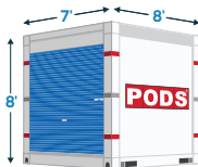
8' Container Cubic Feet: 385*

Three container sizes* - perfect for any size project.