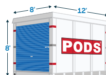
12' Container Cubic Feet: 689