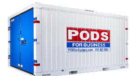
16' All-Steel Container Cubic Feet: 835